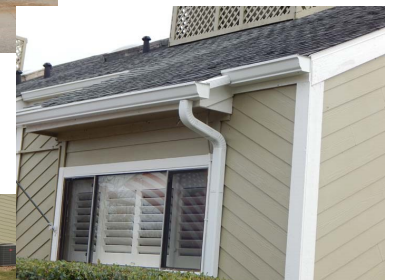
New signage and landscaping

Gutters installed where needed. Continuing in 2019.