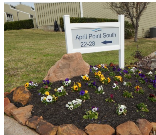
New pool furniture