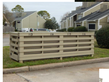
New trash containers. More will be done in 2019

Gutters installed where needed. Continuing in 2019.